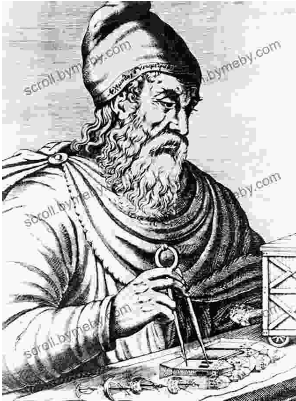
Medieval Prayer: A Window into the Past

Archimedes of Syracuse (c. 287-212 BCE) stands as one of the greatest scientific minds of all time. His contributions to mathematics, physics, and engineering continue to shape our understanding of the world around us. From his groundbreaking work on buoyancy to his invention of the lever, Archimedes' legacy has left an indelible mark on the history of science.