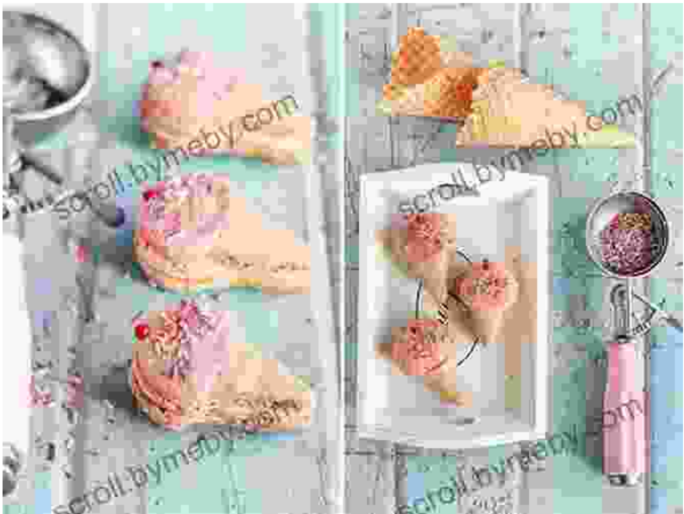
The Complete Ice Series Box Set by Jennifer Comeaux

Embark on a captivating adventure into the frozen realm of ice cream with "The Complete Ice Box Set," a comprehensive collection that unravels the delectable secrets of this timeless treat.