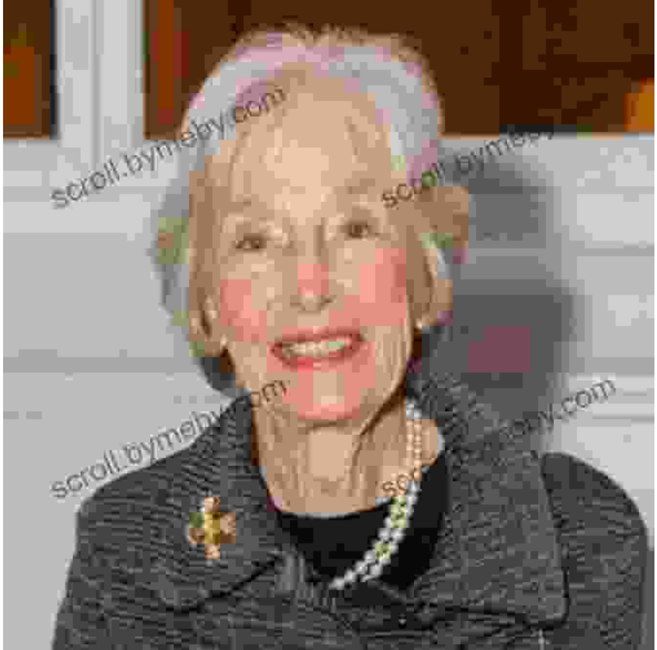
Rosalie Edge, Hawk of Mercy: The Activist Who Saved Nature from the Conservationists (Wormsloe