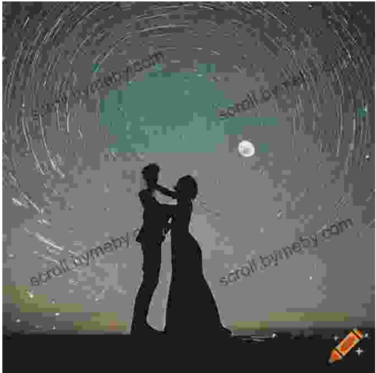
Autumn's Golden Tapestry

Dream" transports you to a realm of enchantment, where a mischievous sprite weaves a web of tangled threads, testing the boundaries of love and destiny. As fireflies dance amidst the twilight shadows, secrets are whispered and hearts flutter with both anticipation and trepidation.